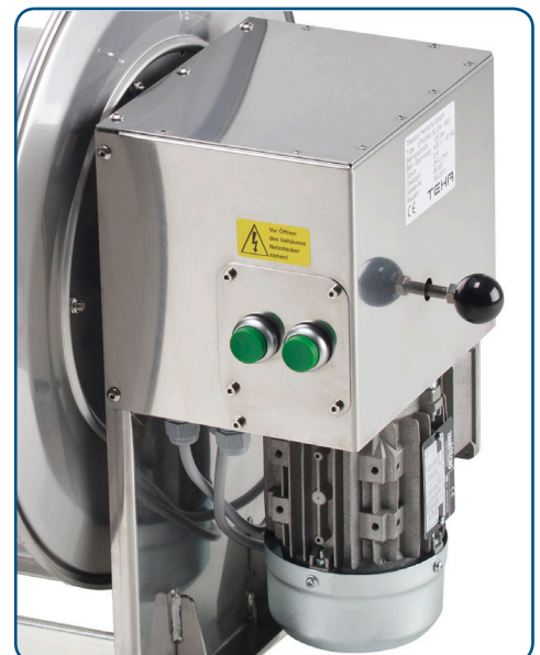
Driving and mode of operation